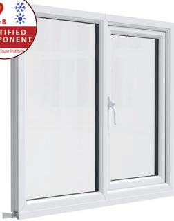
Casement Window (Available in Zero|90R)