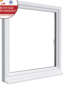
Tilt & Turn Window (Available in Zero|90R)